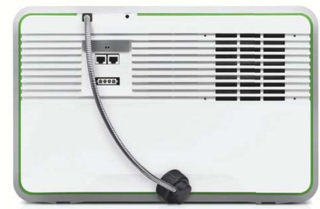
Authorised EFOY dealer